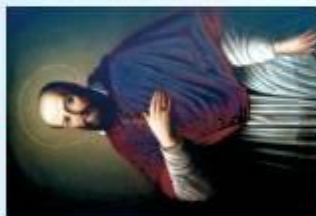
ST. FRANCIS DE SALES (1567-1622)

The college is privileged to have a Saint as its Patron in the person of Francis de Sales whose blessings and prayers the college invokes both on students and staff. The college celebrates the patron's day on 24th January every year.