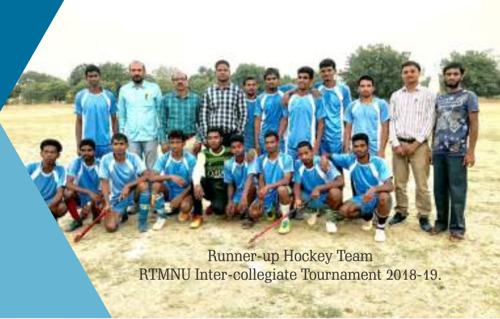
Runner-up Hockey Team RTMNU Inter-collegiate Tournament 2018-19.

SFS College caters to budding minds to excel in academics and encourages active participation in sports to teach a code of conduct, judgement, fair-play, precision and be sportive.