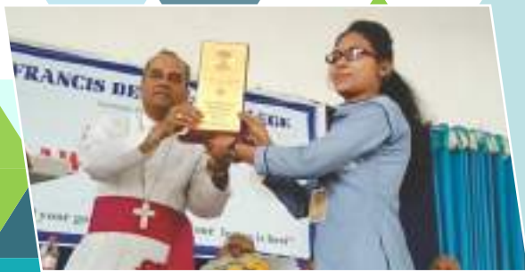
Best Student - Degree College