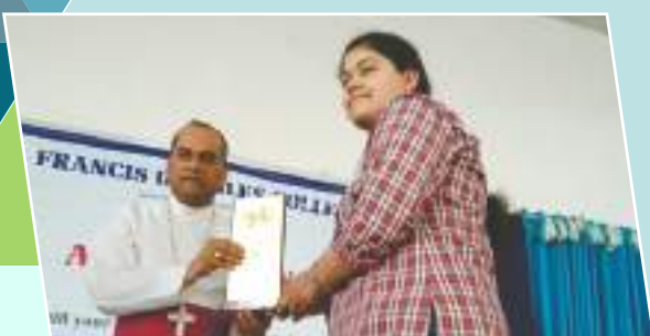
Best Student - Junior College