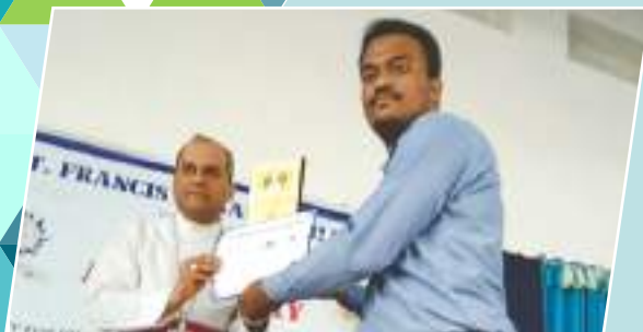
Best All Rounder